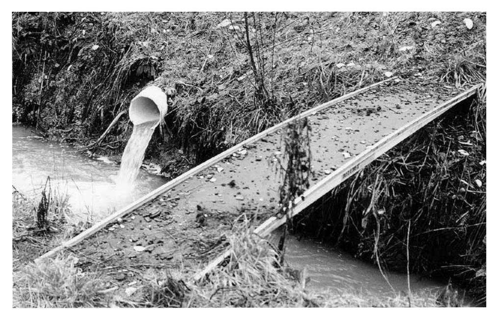
At the Izaak Walton League shooting range, tests have found toxic levels of lead in sediments in Spencer Creek. The League's discharge of lead to streams is aggravated by flooding, unlawful development, and shooting at metal targets.