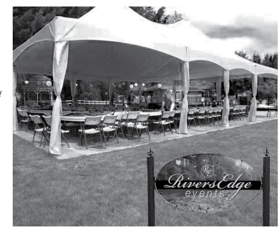
One of the unpermitted new structures, ruled "existing" on the Shrives' property in the Willamette River Greenway