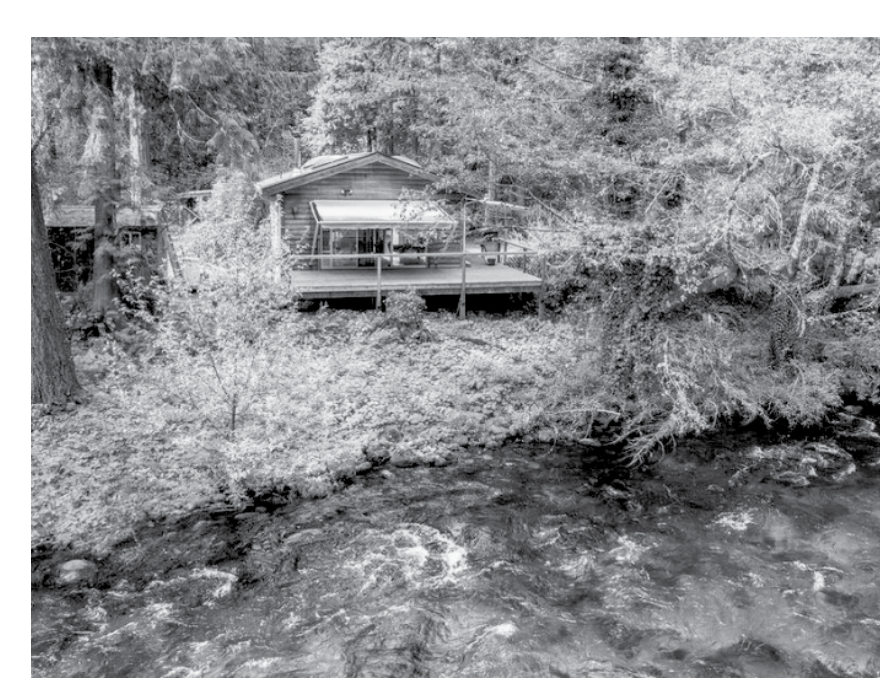
House invading the McKenzie River riparian zone

On Sept. 13th we took staff and directors from the United States Environmental Protection Agency down the river to view the riparian and water quality conditions. They were stunned by the impacts they discovered.